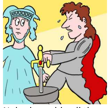
Nobody could pull the sword from the stone, so they decided to have a contest to see who was strongest instead.