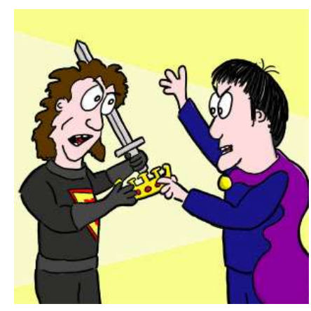
The other lords of the land fought as to who would become king.