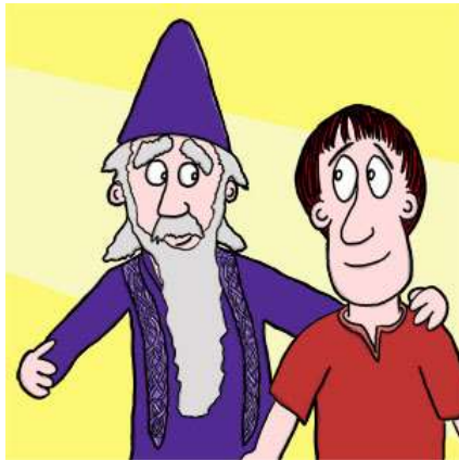
Merlin explained that Arthur was Uther's son.