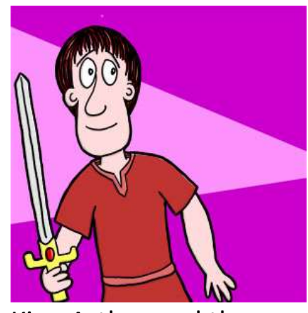
King Arthur and the Enchanted Sword