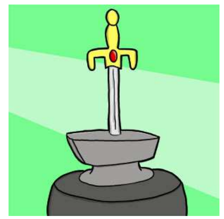
An inscription on the stone read, "Whoever pulls this sword from the stone is the true born King of all Britain."