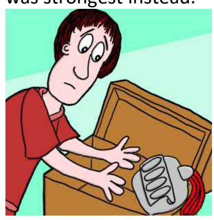
Arthur went back home to get the sword but he couldn't find it.