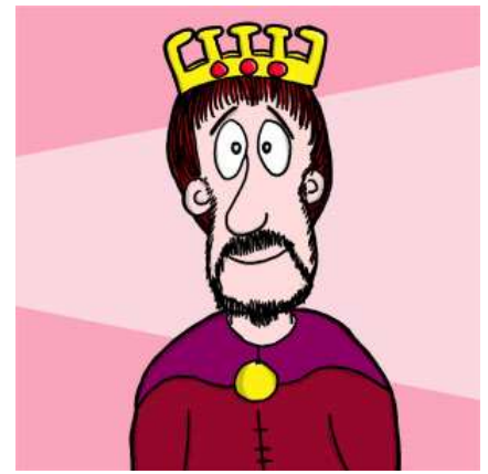
Arthur was crowned as "the true born King of all Britain".