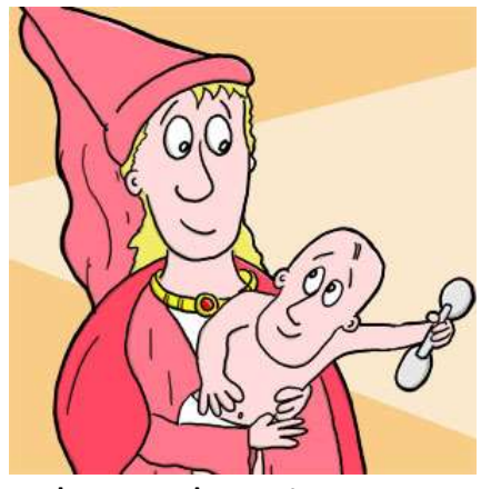
Uther and Igraine were married and they had a baby son, Arthur.