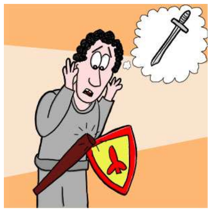
Sir Kay was in the tournament but he'd forgotten his sword.