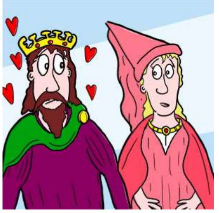
King Uther loved Igraine of Cornwall but he couldn't marry her.