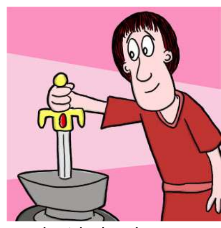
He decided to borrow the sword in the stone for Kay to use.