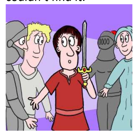
Word soon spread that Arthur had pulled the sword from the stone.