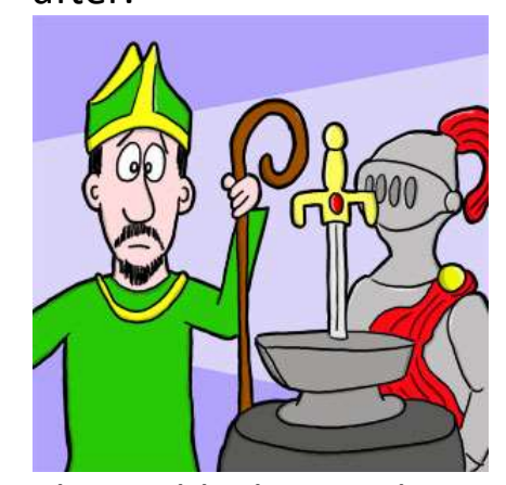
The Archbishop and Merlin called all the people to the church. A magical stone had appeared.